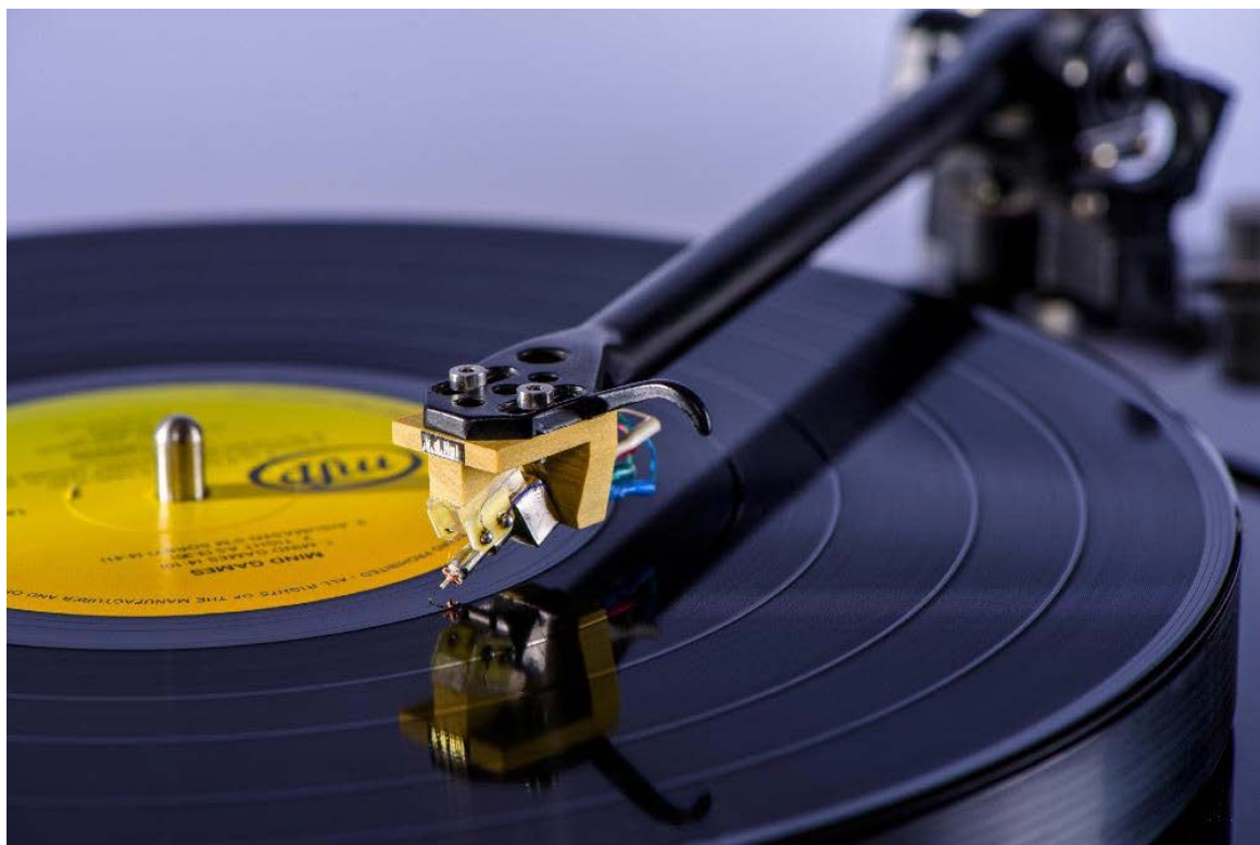
The Colibri XGW 'Master Signature'