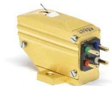
MC – 10 Special