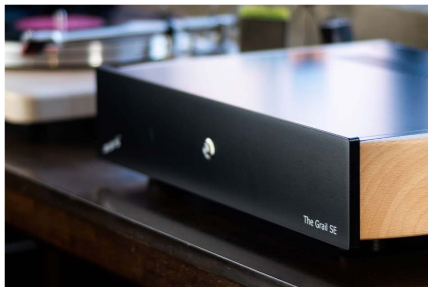
The GRAIL SE Amp