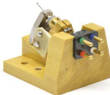
The Crimson XGW 'Master Signature'