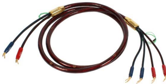
The Nova – Mounted as bi-wiring set with gold plated BERRI busconnectors