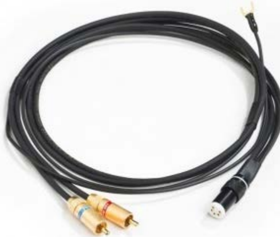
The D- 501 Silver Hybrid, mounted with RCA 4.0 and TAC connectors.