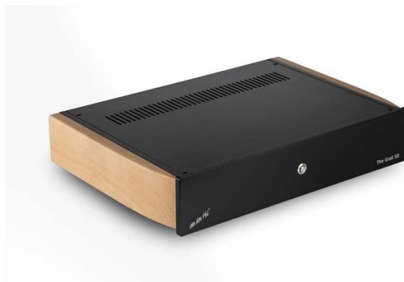
The Grail SE Amp