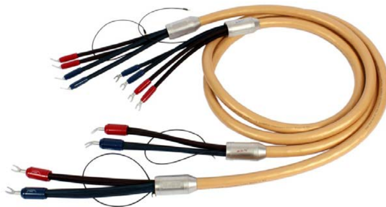
3T The Cumulus