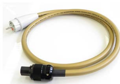
M.C. The Mainsstream Hybrid – mounted with Schuko – IEC connectors.