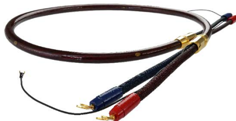
The Super Nova – Mounted as stereo pair with gold plated BERRI busconnectors