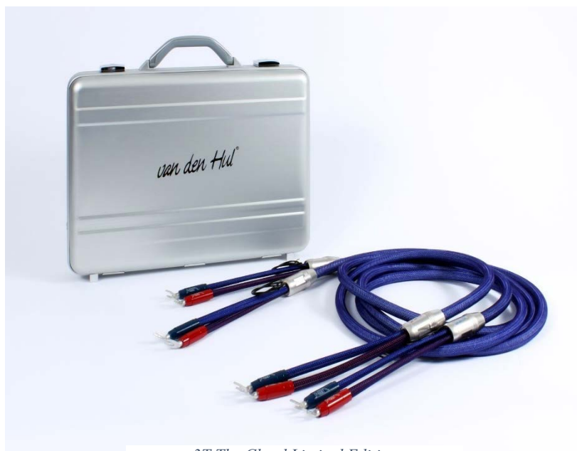
3T The Cloud Limited Edition