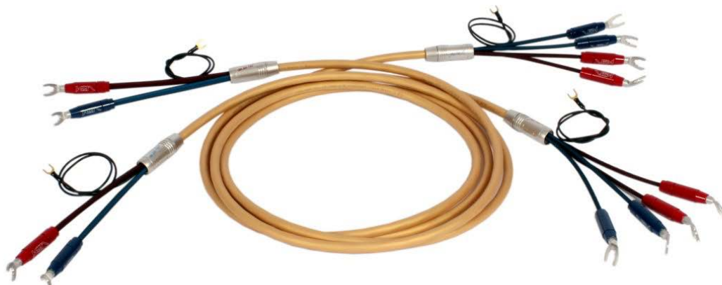
3T The Air