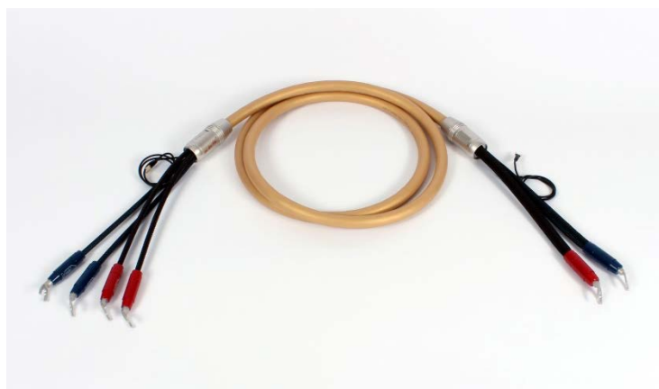
3T The Cloud – Mounted as bi-wiring set with rhodium plated BERRI busconnectors