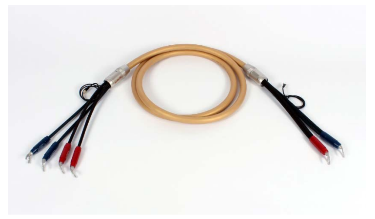
3T The Cloud – Mounted as bi-wiring set with rhodium plated BERRI busconnectors