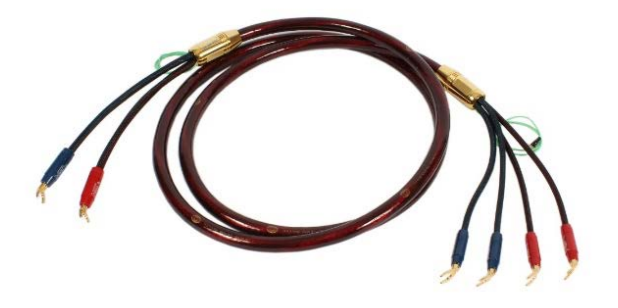
The Nova – Mounted as bi-wiring set with gold plated BERRI busconnectors