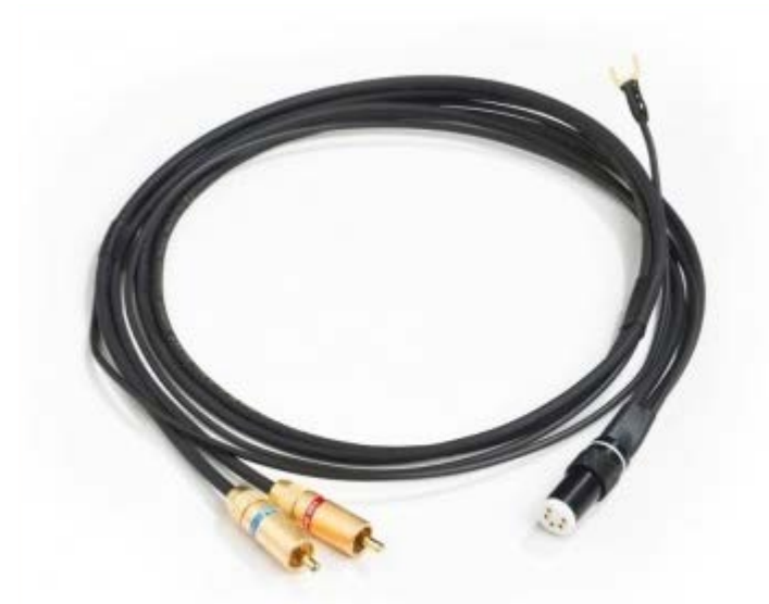
The D- 501 Silver Hybrid, mounted with RCA 4.0 and TAC connectors.