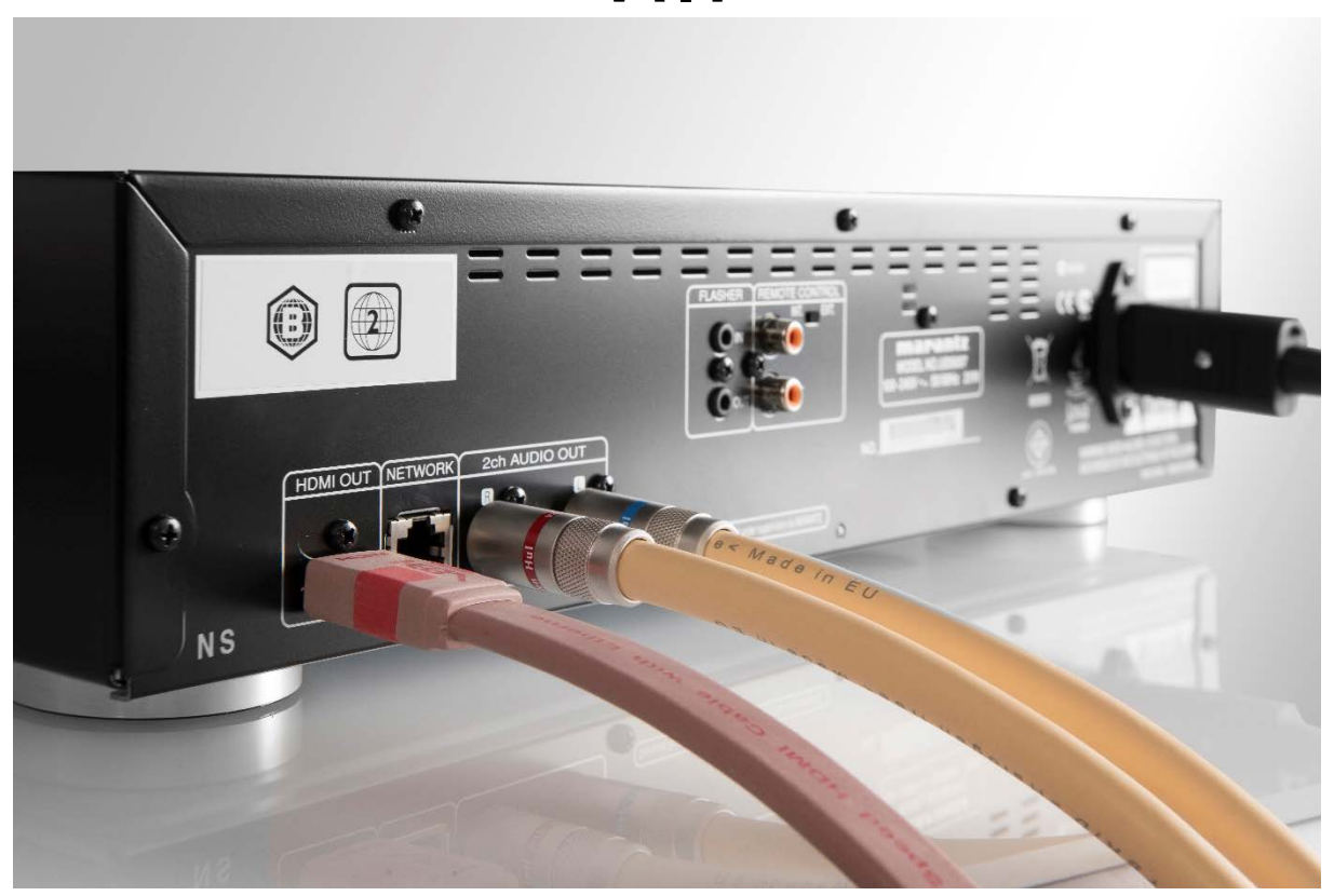
The Link between Technique and Emotion

A.J. van den Hul B.V. - The document is meant for internal use by official distributors of A.J. van den Hul B.V. only. Any other use and any form of multiplication is prohibited. A.J. van den Hul B.V. holds the right to update the content and prices before the end of September 2023.