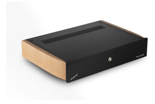
The Grail SE Amp